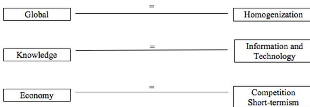
Figure 1: Global Knowledge Economy – Ideological Stasis and Homogenisation

In addition to this fragmentation, commodification of knowledge abounds as a socio-cultural by-product of globalization. Borrowing heavily from industrial era metaphors, education is now marketed as the product in a globally competitive “knowledge industry.” The insinuation of neoliberal economic theory into all walks of life—including education—has led to the reframing of education as a subset of the new “knowledge economy.” In this new knowledge economy we can witness nations and regions scrambling to grab market-share through creating “science parks”, “education cities” and “knowledge hubs.” The most disturbing aspect of this “globalization of knowledge” is that it frequently reflects homogenization. This McDonaldization (Ritzer, 2008) of education transplants outmoded models and approaches as if they were fast-food franchises with little regard to the quality of the learning experience for students or the cultural context in which the model is implanted. In the rush to the top of the globally competitive league tables there appears to be a blind disregard for epistemological and cultural diversity, through alternative ways of knowing. With their embeddedness in the global economy such approaches to global knowledge are also locked into short-termism, stasis and homogenization, see Figure 1.