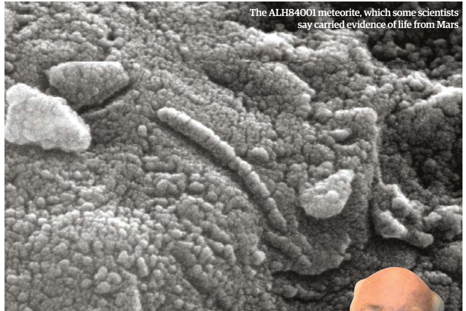
The ALH84001 meteorite, which some scientists say carried evidence of life from Mars

Life as we know it requires three crucial ingredients, namely RNA, DNA and proteins. RNA, or ribonucleic acid, forms through a difficult process of 'templating' atoms on the crystalline surface of minerals. The minerals required for this templating to occur would likely have dissolved in the seas of the young Earth if it was covered in a global ocean, as has been suggested, but they could have more