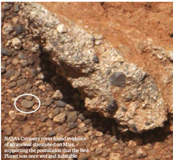
NASA's Curiosity rover found evidence of an ancient streambed on Mars, supporting the postulation that the Red Planet was once wet and habitable

Benner's research is based around the assumption that Earth was once wholly covered in water. This might sound conducive for life but, in fact, it is quite the opposite. Life is dependent upon polymerisation chemistry, which is the